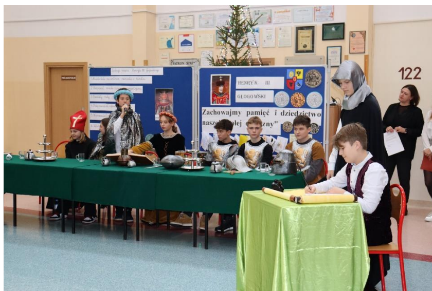
Henry III, Duke of Głogów

Our School Patron is Henry III, Duke of Głogów . Henry III is a model worth imitating. He was very harsh on raiders and thieves. During his times, there was general peace in Polish lands. Henry was also a generous founder of the church. To him we owe the establishment of the monastery of the Magdalenians in Bytom on the Oder River and the Poor Clares in Głogów.